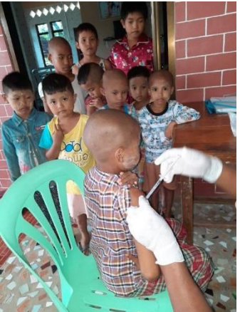
Resident volunteer doctor