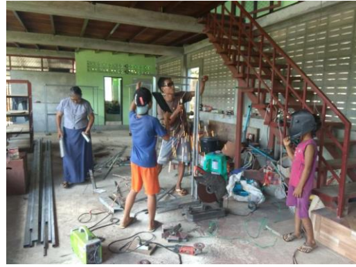
Vocational Training Activities