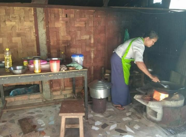
Nutrition support activities