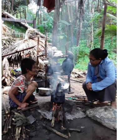
Distribution for poor family during Covid-19