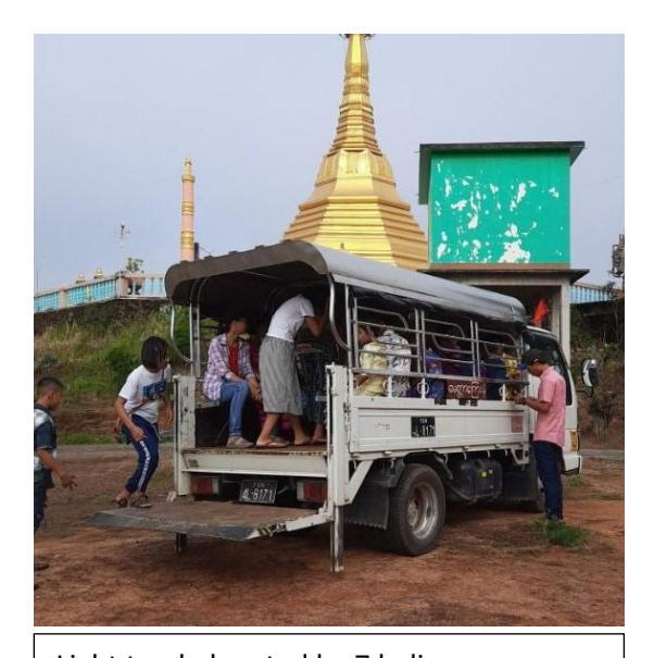
Light truck donated by 7 ladies