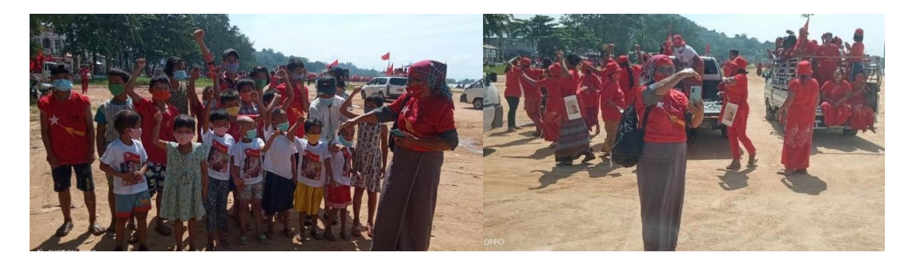
Together with the people for National General Election 8th November 2020

- Polictical General Election on the 8th November was the most exciting event for the whole country because of its importance. Being the citizens of the country and for the life experience of our small children, all of us at the HIV Center took part in the public demonstration in procession together with the people around us which went through the whole town. But no religious is allowed to vote. We are on the fight for this basic human right.