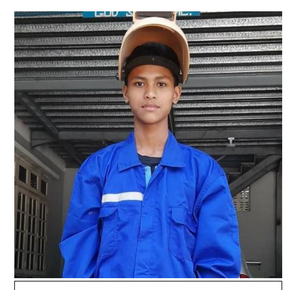
Welding training for a young boy

- On the 12th May, four children under ten years from a family of a homeless migrant widow mother were brought to us by the Department of Social Welfare with the agreement of the village Headmen and elders. - In July, a tube well was dug in view of distributing water to the poor migrant families in the neighborhood who struggle to have clean water during the summer when wells get dried.