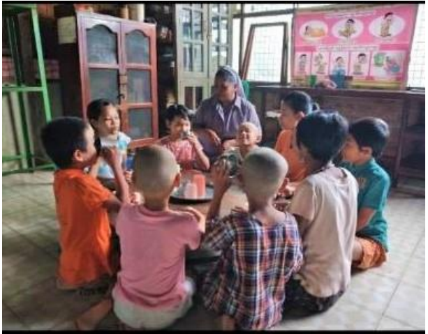
Regular drug intake