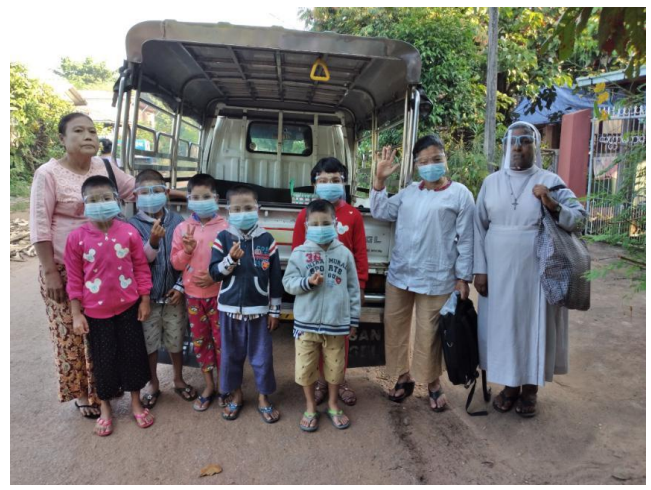
Monthly drug collection to various hospitals and clinics in different towns

This year, in spite of the Pandemic, our children are in good health. The usual seasonal Denque fever is absent this year. When needed for the minor medical consultation, we phone our family doctor to avoid virus transmission and give treatment according to the advice.