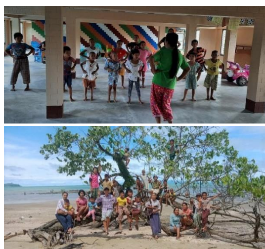
Psychosocial Support activities